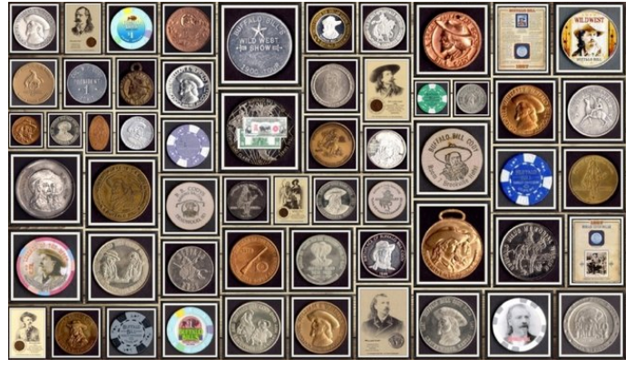
Metal, Plastic & Wood Coins, Rounds & Tokens