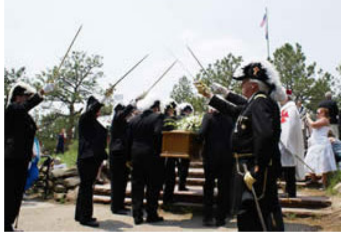
Here, the AF & AM salute Buffalo Bill in fine style.

Now, 100 years later, the Buffalo Bill Memorial Museum will host members of the Grand Lodge No. 1 of Golden Colorado, as