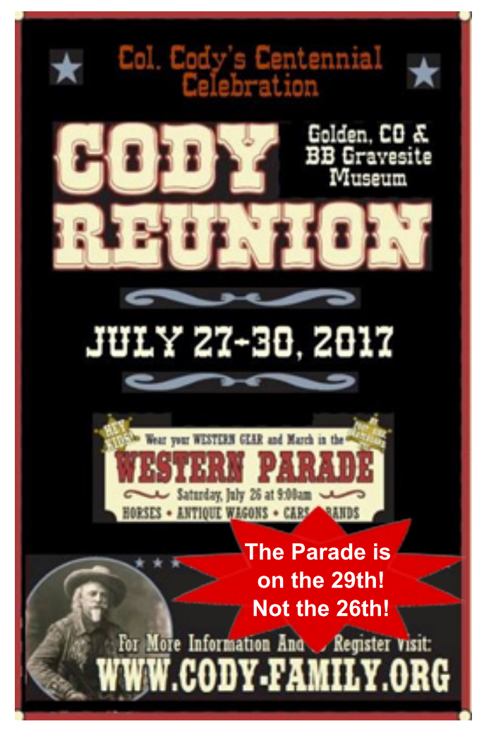
Join us in Golden for the 100th anniversary of Buffalo Bill's burial! This solemn Masonic ceremony will be conducted graveside on Friday, July 28 at 3pm.

But never fear, it won't be all black crepe and bowed heads, for its Buffalo Bill Days in Golden Colorado! The Major Summer Weekend for this bustling city at the foot of the Eastern Slope. There'll be a Parade, a Wild West Show, live music, a golf tornament, an antique car show and the Rubber Duck Race for charity on Clear Creek.