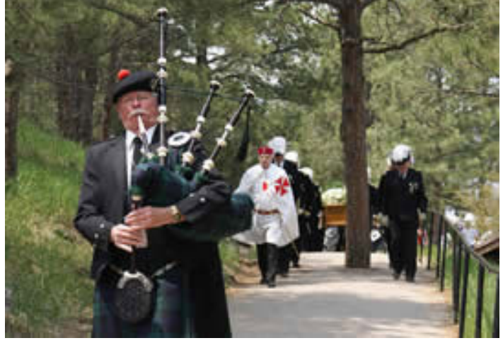
A piper leads the Lodge Brothers to Buffalo Bill's grave.

When Buffalo Bill was buried on this day, June 3, 1917, an esimated 20,000 spectators ascended the winding trail of Lookout Mountain to see the famous frontiersman laid to rest in what is touted as the largest burial in Colorado history.