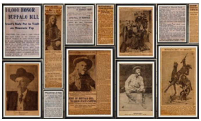
News Clippings These are only 5 of the 18 catagories already on display.

Let us not forget our past, but remember who we are and where we came from. We should embrace, understand and learn from our history and heritage and pass this legacy to future generations. Please share this online experience with your children so that our past will not be forgotten, but remembered, honored and even celebrated!